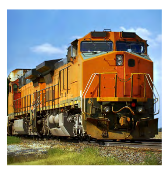
RAIL=Fuel Efficiency. One gallon of fuel can move one ton 400 miles.

The region has a first-class transit infrastructure that transports products, people and services domestically and worldwide. It gives Southwest Ohio superior access to profitable markets in major cities and ports throughout Ohio, the Midwest and the East Coast.